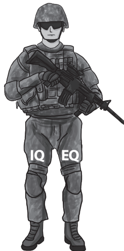
Figure 1: The importance of the modern military leader standing solid on two feet based on emotional and cognitive intelligence and competences.

people have a congenital capacity for emotional skills, where others like Lutz (1988) argued that particular cultural systems, social and material environments will inevitably structure emotional meaning, and claimed that emotional experience is predominantly cultural. Among other things, the experience taken on board during emotional problem solving often determines the extent to which emotional capacity is developed into intrinsic skills. Research by Damasio (2003) has shown that human beings cannot make any cognitive decisions without also processing emotional information that incorporates how we feel about a particular situation. Emotions can be changed, constructed and developed, they are functional and they support rational and cognitive thinking, which is a substantial part of a military leader's job in operational planning and decision processes. It is imperative that the military leader conducts his or her leadership standing on two feet, so to speak, as illustrated in Figure 1. Therefore, focusing on emotional intelligence is a very meaningful exercise, especially for military leaders.